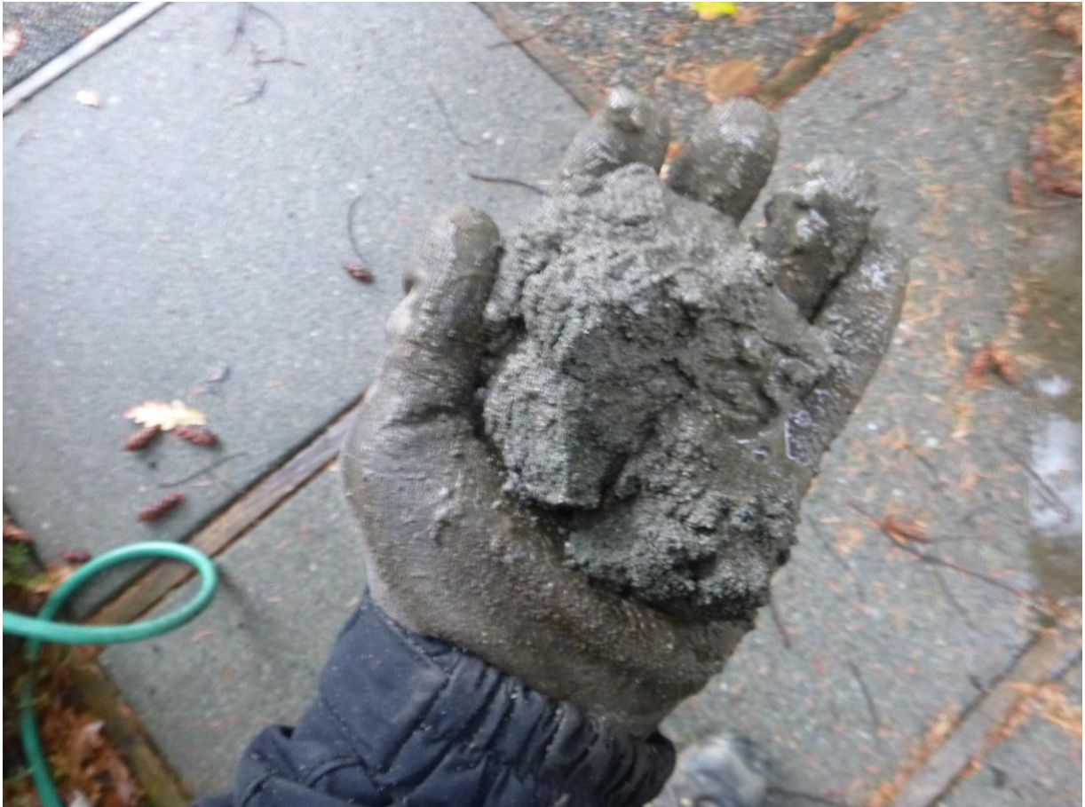
Plate 1. Cuttings from about 3 feet below the surface in HB-2. Wet, gray, medium SAND with trace silt.