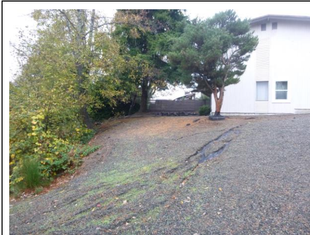
Plate 1. View of the southwest side of the house. Looking north.

We understand that you plan to construct an addition to the southwest corner of the existing house. Based on a review of the preliminary design plans, the addition will be a two-level structure matching the existing house. We anticipate that site grading for the addition construction will involve cuts and fill on the order of 3 feet.