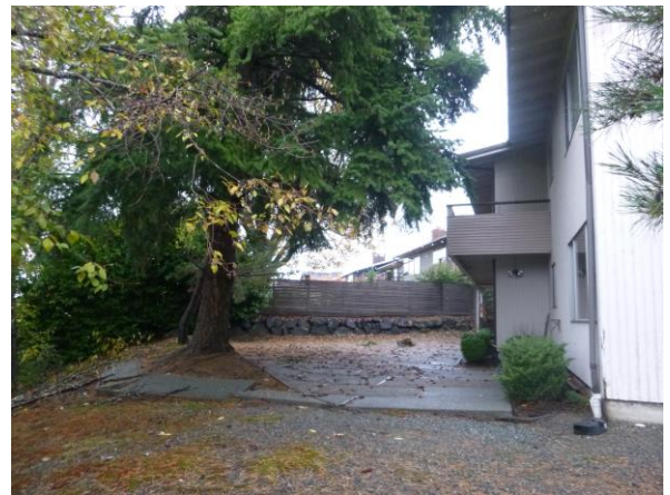
Plate 2. View of the north side of the site. Looking northeast.

The conclusions and recommendations outlined in this report are based on our understanding of the proposed development, which is in turn based on the project information provided to us. If the above project description is substantially different from your proposed improvements, or if the project scope changes, PanGEO should be consulted to review the recommendations contained in this study and make modifications, if needed.