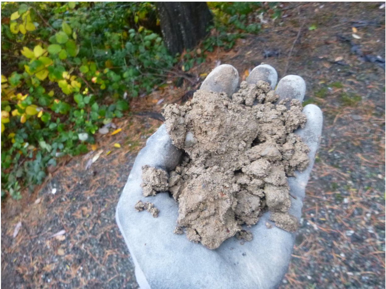
Plate 1: Cuttings from about 3½ feet below surface in HB-1. Moist, light brown, medium SAND with gravel and trace silt.